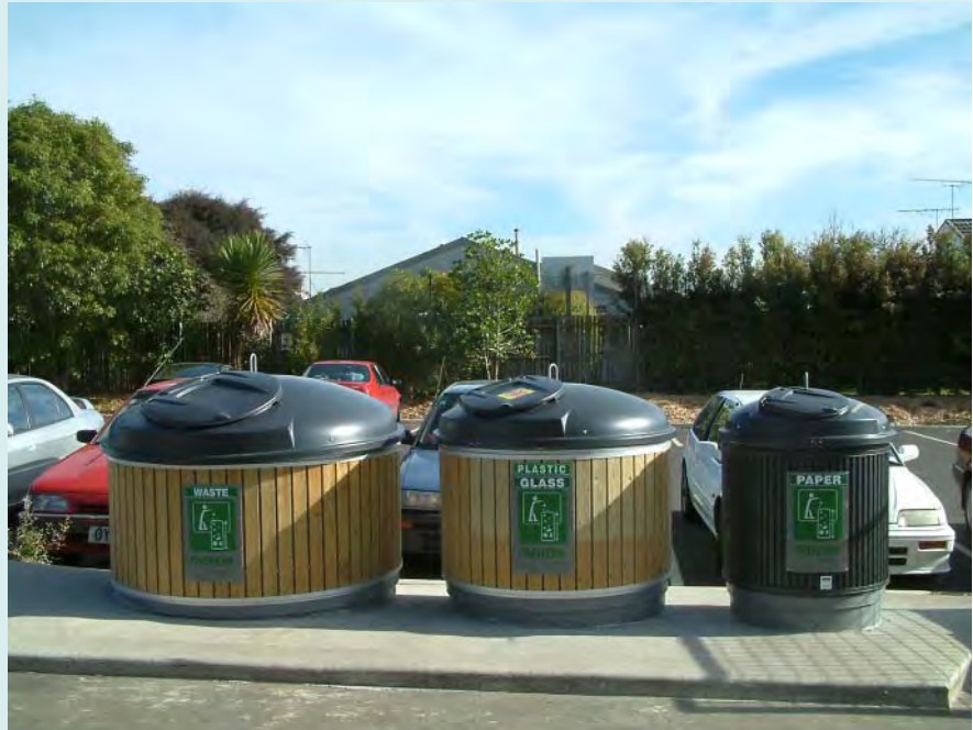
The first Molok's in New Zealand at the Auckland Technical University area.