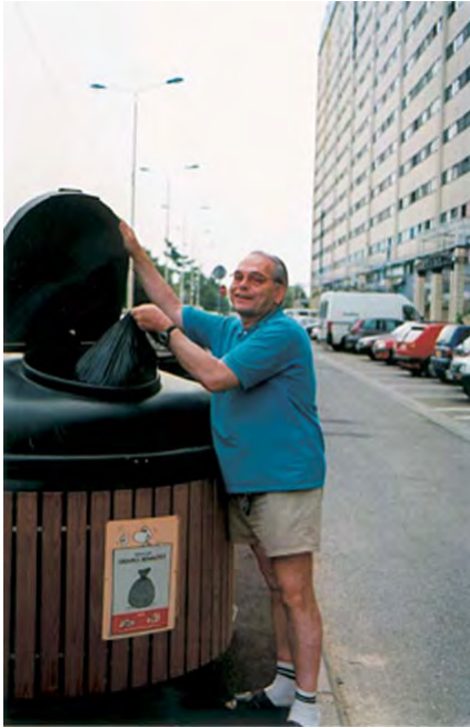
According to Mr. Francois Bouché, the Moloks arrived just in time.

The change to Moloks was also backed up with a series of marketing activities, specially targeted at children, and with a special song contest, held around the theme of waste recycling.