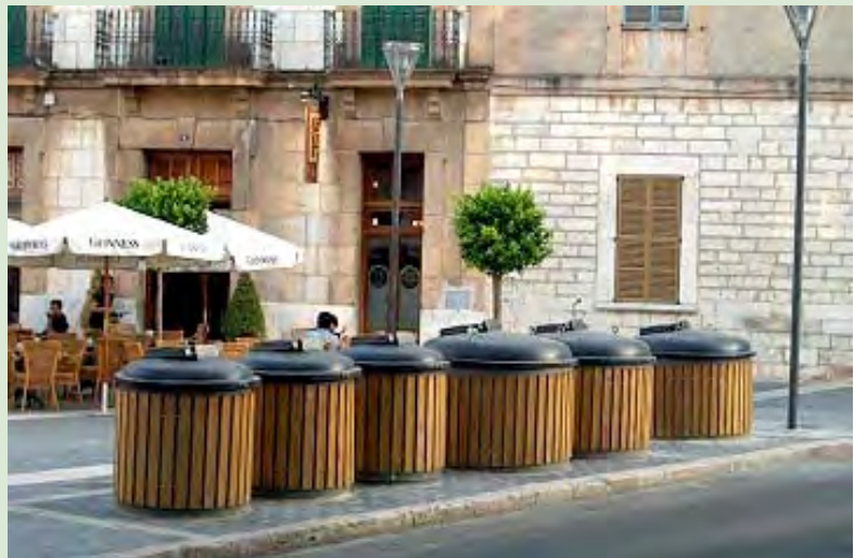
A full-range Molok recycling point with six containers in Inca, Mallorca.

Spain is today one of the most rapidly growing markets for Molok. During the past few years, Molok Iberica has sold several hundred deep collection system containers to different cities.