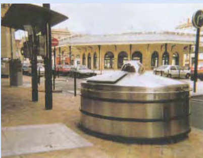
The impressive stainless steel Molok is located right in the centre of Bordeaux.

At the special request of the city mayor, Mr Alain Juppé , the five cubic metre Molok has been covered with inox stainless steel.